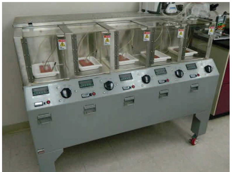
ELTEK Labs' Custom Built Inclined Plane Test Machine